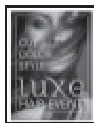
1/4 Page Layouts