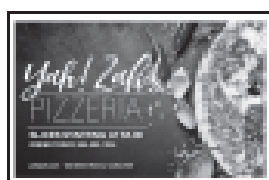
1/2 Page Layouts